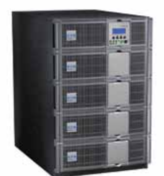
Eaton MX Frame