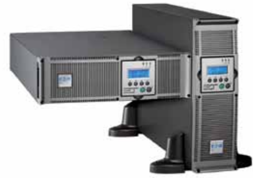
Eaton MX versatility