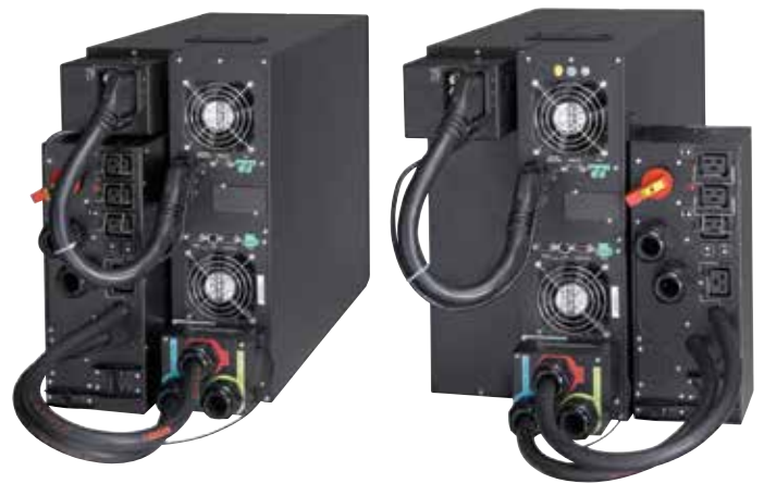
Eaton 9PX UPS with Maintenance Bypass

For easier integration, Eaton HotSwap Maintenance Bypass (MBP) can be mounted on the UPS in multiple ways, as well as being rack and wall mountable as standard.