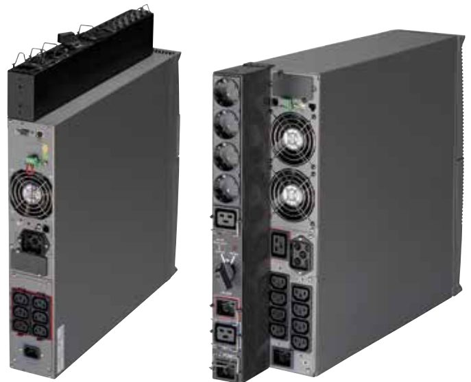
Eaton EX with Maintenance Bypass