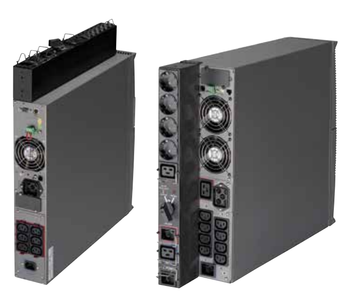
Eaton EX with Maintenance Bypass