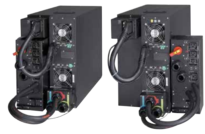
Eaton 9PX UPS with Maintenance Bypass

For easier integration, Eaton HotSwap Maintenance Bypass (MBP) can be mounted on the UPS in multiple ways, as well as being rack and wall mountable as standard.