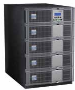
Eaton MX Frame