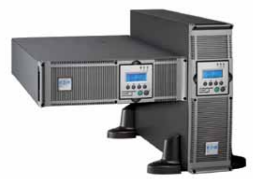
Eaton MX versatility