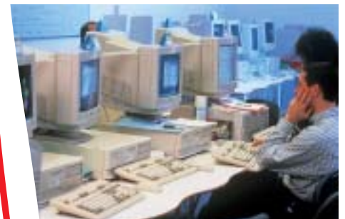
Maximum endurance for the most sensitive applications.