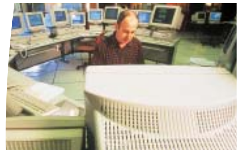
A UPS which is easy to install and operate in order to safeguard the productivity of your equipment.

Protection for 1 to 3 workstations or small servers