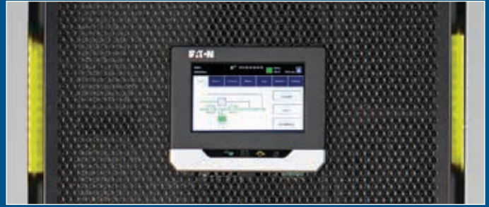
Battery mode (blinking)