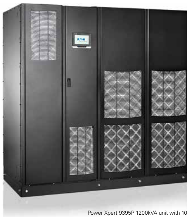
Power Xpert 9395P 1200kVA unit with 10" display and optional LED status lights