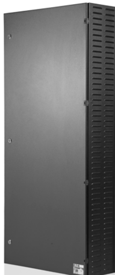
External MBS 100kW and 150kW door closed