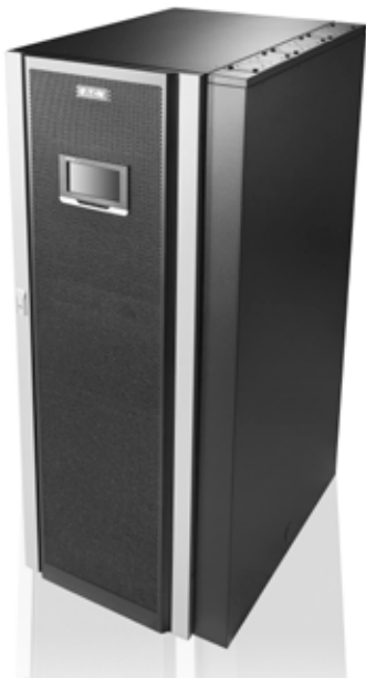
Eaton 93PM 30-150kW unit with Top cable access kit