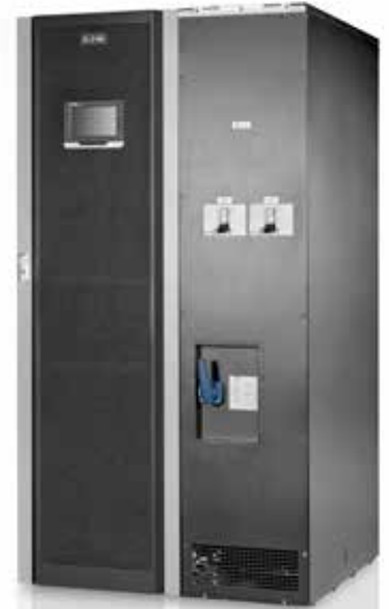
Eaton 93PM 200kW unit with SIAC MBS 4 switches (door removed)

The Top Cable Access -kit adds ample space for top cable entry whilst maintaining a compact footprint. This kit is available for 30-150kW 93PM units.