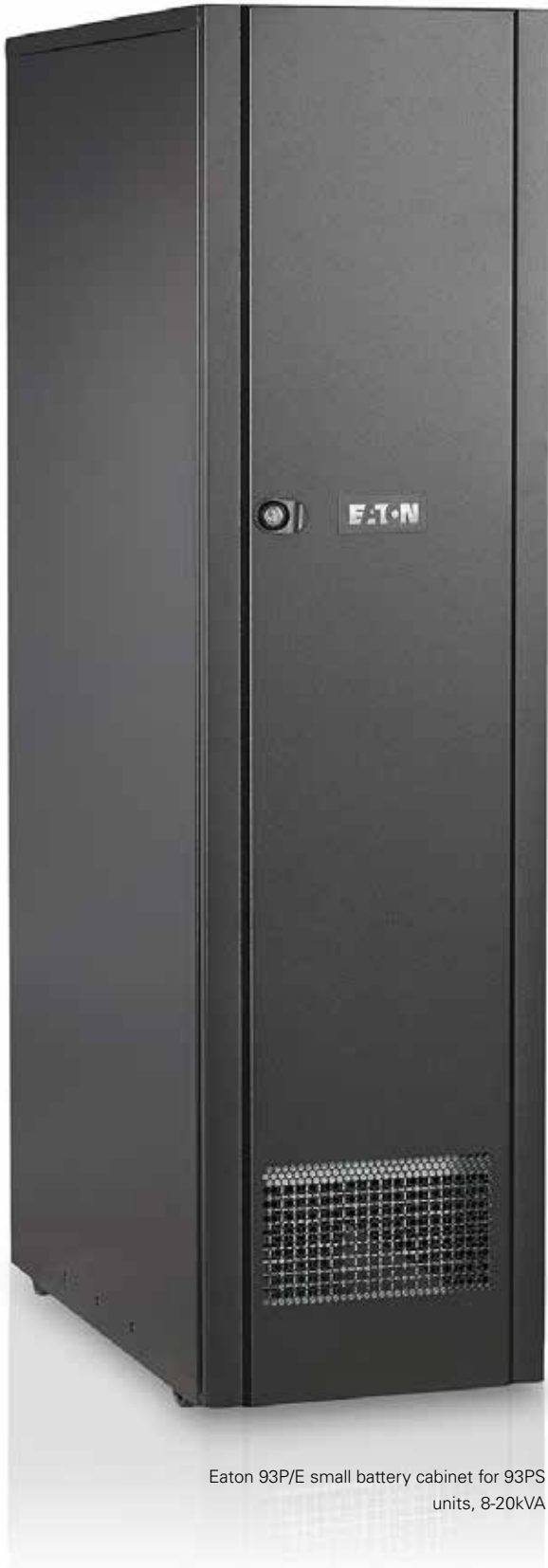
Eaton 93P/E small battery cabinet for 93PS units, 8-20kVA

Eaton battery cabinets for 3ph UPSes minimize footprint, maximize safety and serviceability. In the offering there are empty cabinets, but also preloaded cabinets with batteries installed to reduce site installation time. All the Eaton battery cabinets are designed by the UPS standard IEC 62040.