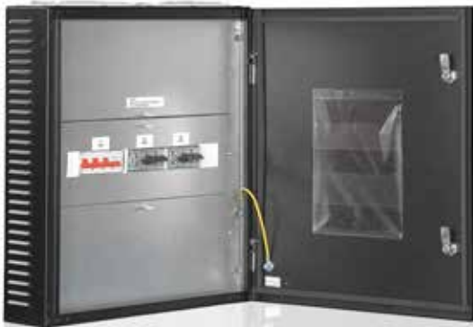
External MBS 50kW

External Maintenance Bypass Switches (MBS) add safety and reliability by enabling seamless transfers to bypass and isolation of the UPS system for maintenance. Eaton external MBSs are designed by UPS standard IEC 62040.