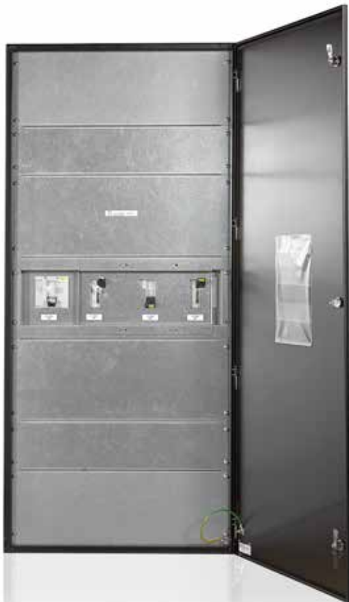
External MBS 100kW and 150kW