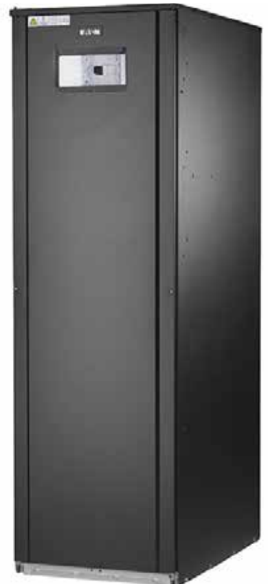
Eaton 93P/E small battery cabinet for 93PM and 93E units, 30-150kVA

Contact local Eaton sales for support with runtimes and battery cabinet selection