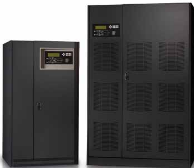
Eaton 93 STS family