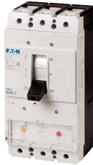
Eaton Circuit-breaker, 3p, 400A, NZMN3-A400