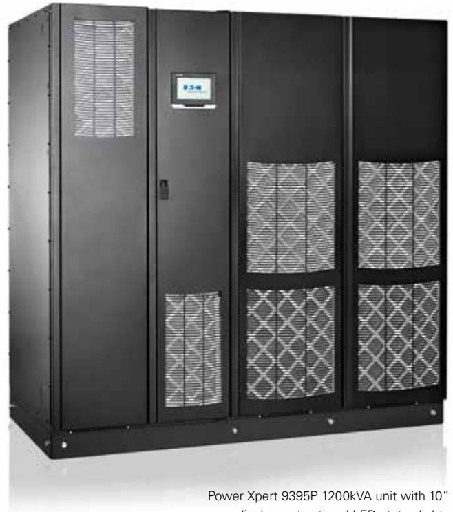
Power Xpert 9395P 1200kVA unit with 10" display and optional LED status lights