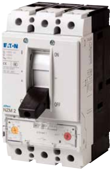
Eaton Circuit-breaker, 3p, 200A, NZMN3-A200

Kits include a breaker, and a shunt trip coil for remote tripping. 700A version also includes the extension handle. See separate datasheets for more detailed info.