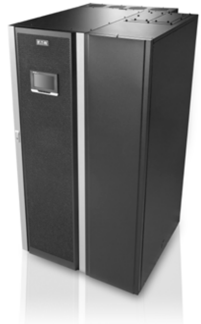
Eaton 93PM 200kW with SIAC MBS and Top air exhaust kit

Sidecar Integrated Accessory Cabinet (SIAC) MBS option for the 93PM 200kW frame, expands the internal MBS offering up to 200kW. Sidecar MBS option adds safety and reliability by enabling seamless and easy transfers to bypass for the UPS system maintenance. There are two different alternatives available, one with three switches: MBP+MIS and RIB, and one with four switches MBP+MIS, RIB and BIB. This kit can only be assembled on the Eaton factory.