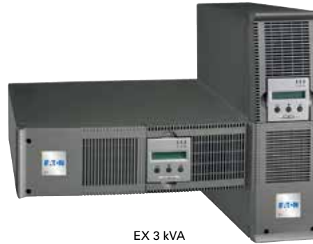
EX 3 kVA

DNV type approved, BV type approved and ABS design assessed up to 15kVA, double-conversion online technology with power ratings 8-10kVA, single-phase input and output, 8-30kVA, three-phase input and single-phase output and 8-160kVA three-phase input and output, small foot print, patented Hot Sync® parallel capability up to four redundant systems, ABM™ technology to extend battery service life, wide communication options.