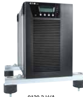
9130 3 kVA

DNV and ABS type approved on-line double conversion UPS with automatic bypass, tower or Rack/Tower versatile, multilingual LCD display, hot swappable batteries, power management software, USB and Serial port.