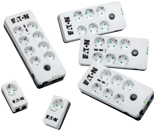
Eaton Protection Box range