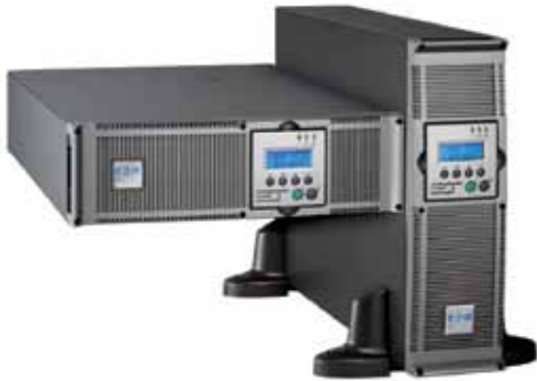
Eaton MX versatility