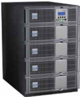
Eaton MX Frame