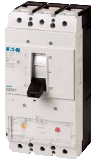
Eaton Circuit-breaker, 3p, 400A, NZMN3-A400